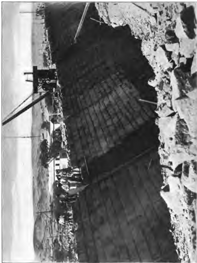
ASSOUAN BARRAGE, BATTER WORK ON DOWN-RIVER SIDE OF BARRAGE.